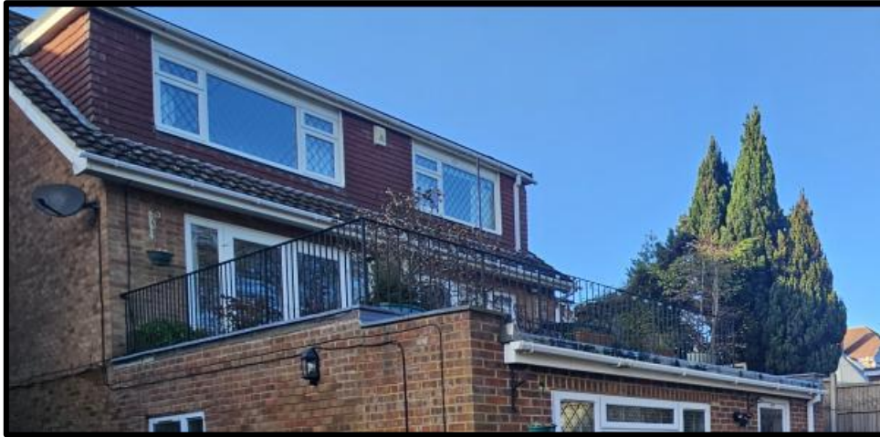
Figure 1 – Soft landscaping separating No. 49 and No. 47 Taken in winter (Dec 2025)

In light of the above, officers are satisfied that the proposal would not result in a material loss of light to Nos. 51 or 47 nor would it adversely impact the outlook of any habitable windows, and this has been fully and accurately considered in the assessment of this application.